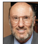
Dr. Walter Block (via Zoom) mises.org/block