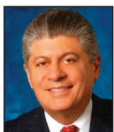
Judge Andrew P. Napolitano mises.org/napolitano