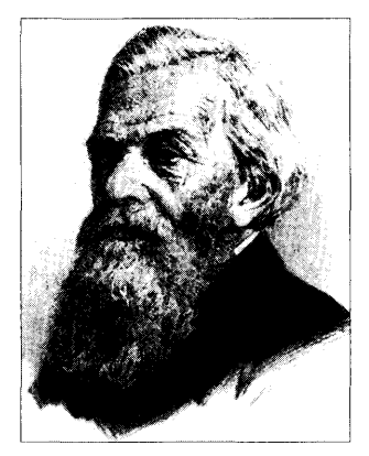
Carl Menger 1840–1921

DESPITE THE MANY illustrious forerunners in its six-hundred-year prehistory, Carl Menger was the true and sole founder of the Austrian School of economics proper . He merits this title if for no other reason than that he created, out of whole cloth, the system of value and price theory that constitutes the core of Austrian economic theory. But Menger did more than this: he also originated and consistently applied the correct, praxeological method for pursuing theoretical research in economics. Thus, in its method and core theory, Austrian economics always was and will forever remain Mengerian economics.