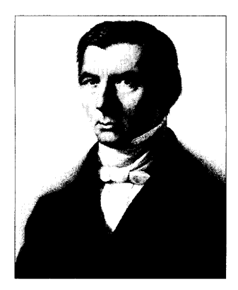
Claude Frédéric Bastiat 1801–1850

CLAUDE FRÉDÉRIC BASTIAT was a French economist, legislator, and writer who championed private property, free markets, and limited government. Perhaps the main underlying theme of Bastiat's writings was that the free market was inherently a source of "economic harmony" among individuals, as long as government was restricted to the function of protecting the lives, liberties, and property of citizens from theft or aggression. To Bastiat, governmental coercion was only legitimate if it served "to guarantee security of person, liberty, and property rights, to cause justice to reign over all."<sup>1</sup>