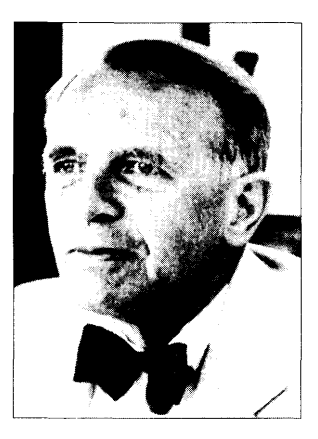
Wilhem Röpke 1899–1966

WILHELM RÖPKE DEVOTED his scholarly career to combating collectivism in economic, social, and political theory. As a student and proponent of the Austrian School, he contributed to its theoretical structure and political vision, warning of the dangers of political consolidation and underscoring the connection between culture and economic systems. More than any other Austrian of his time, he explored the ethical foundations of a marketbased social order. He defended the free market from socialist cultural critics by pointing out that social crises and cultural decline are not the product of the free society; one needs to look to state control, political centralization, the