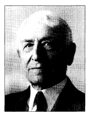
Frank A. Fetter 1863–1949

Using the axiomatic-deductive method, Fetter traced economic laws to individual hu-