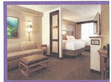
Hyatt Place Double//Double