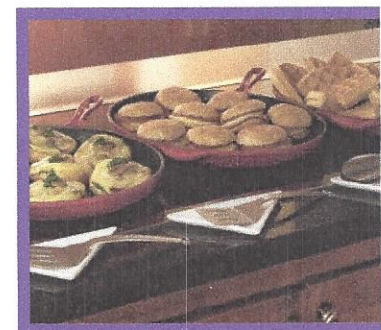
Hyatt Place AM Skillet