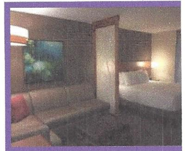
Hyatt Place King Room

1601 Hurst Town Center Drive, Hurst, Texas 76054 817-577-3003 Main / 888-492-8847 Toll Free / 817-577-8388- http://hyattplaceftworthhurst.com/