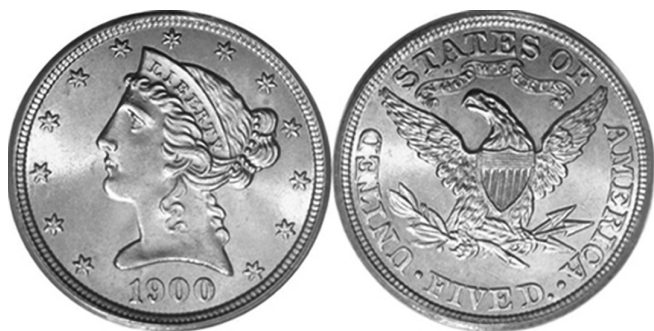
U.S. five dollar gold piece from 1900.

During the greenback paper money inflation of the Civil War, prices rose 183 percent, while wages