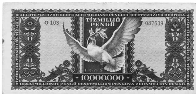
A ten-million pengo inflation note from Hungary, 1946.

theory, without which it is impossible to dispel old economic myths, holds that the value of an economic good exists only in the minds of individuals, and that it can change with circumstances and over time. Prices, and the production decisions which they determine, cannot come from mathematical models in computers.