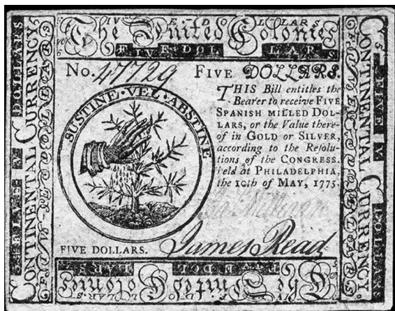
Continental currency; a five dollar note issued in 1775.

confidence in it, made it a rule to part with it as soon as possible." Those who trusted the Congress were destroyed; the cynics were not. As a result of this paper money inflation, wrote one of our earliest economists, Pelatiah Webster, "frauds, cheats, and gross dishonesty are introduced, and a thousand idle ways of living attempted in the room of honest industry, economy, and diligence, which have heretofore enriched and blessed the country. . . .