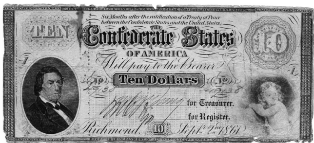
A ten dollar Confederate note issued from the Richmond bank.

They still cling to the idea that wealth and productivity are somehow created by an increase in the number of monetary units. Some otherwise excellent friends of freedom promote this theory, but it offers nothing but economic and intellectual confusion.