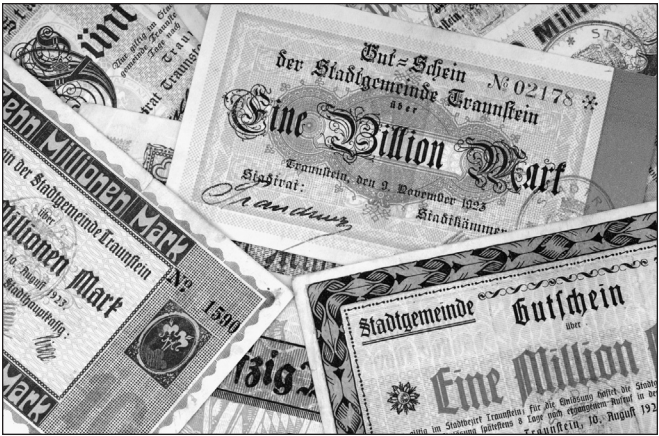
German inflation notes; center is a one-billion mark note from 1923.

Comprehensive Employment and Training Act (CETA). Without a far-reaching change of attitude, the budget won't be balanced, the printing presses will continue to run, the dollar will be further debased, and prices—as a consequence—will continue to rise relentlessly.