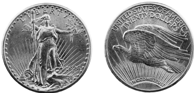
A U.S. $20 gold piece.