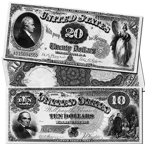
The first legal tender notes were issued in 1862 and came to be called "greenbacks."

The North financed the Civil War with hundreds of millions of dollars of irredeemable Greenback notes, and as a result, prices more than doubled from 1861 to 1865.