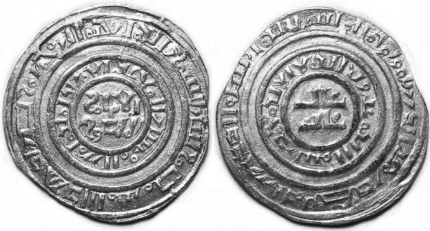
A gold bezant, the major trading coin of Byzantium.

The bezant, however, was minted not by the Chinese, but by the Byzantine Empire. For ten centuries Byzantine coins were accepted all over the world, and Byzantium dominated trade for thousands of miles in every direction from Constantinople. Even the royal accounts of medieval England, says Dr. Sutton, were kept in bezants. The Byzantine Empire only declined when it debased the bezant, adding more cheap alloys and removing gold.