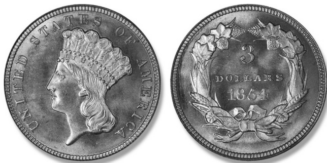
U.S. three dollar gold piece from 1854.

There is no law of economics stating that only gold can be used as money in a free society. But gold has served as the principal medium of exchange throughout history because its value does not depend on a government fulfilling its promises, especially in times of crisis. Gold is scarce; it is portable; it is easily divisible; it is durable; it is desirable for non-monetary purposes; and it is impossible to counterfeit. 1